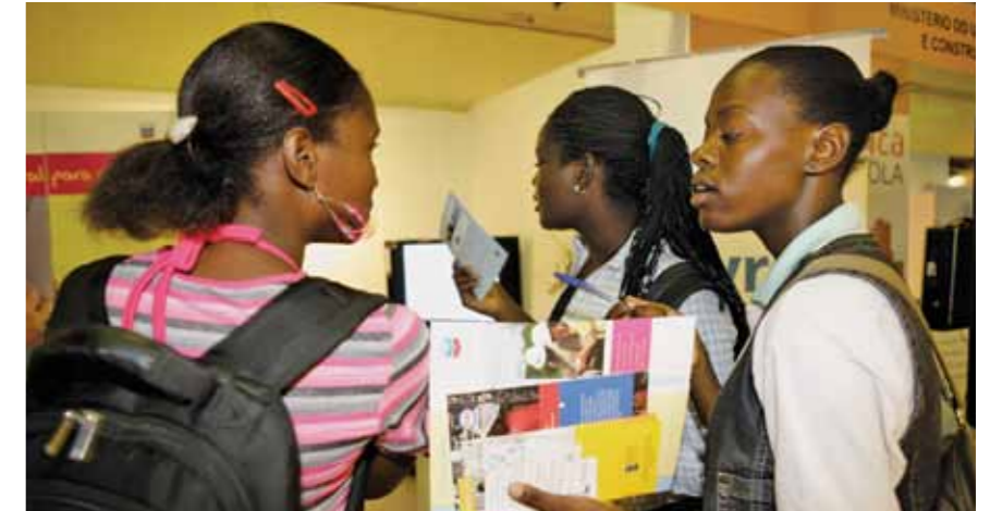
Potential candidates at a job fair

Construction has commenced for teacher resource centers in Luanda and Cunene provinces. The centers will help teachers improve their information technology skills. Each of the centers offers a library of computer