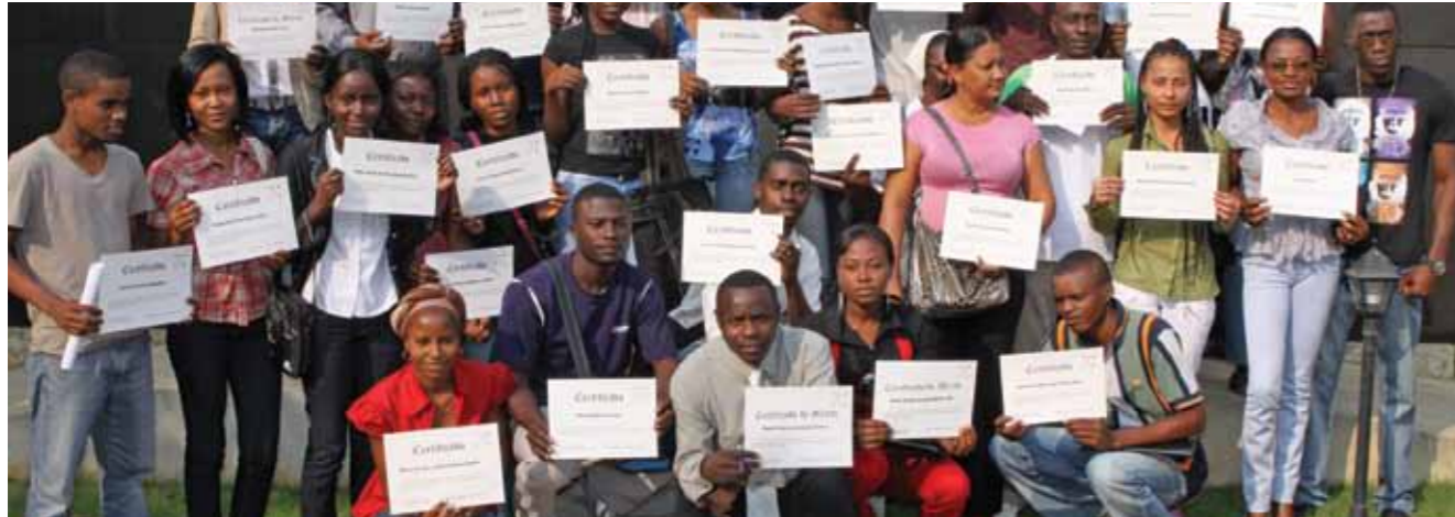
Cabinda students display their scholarship awards