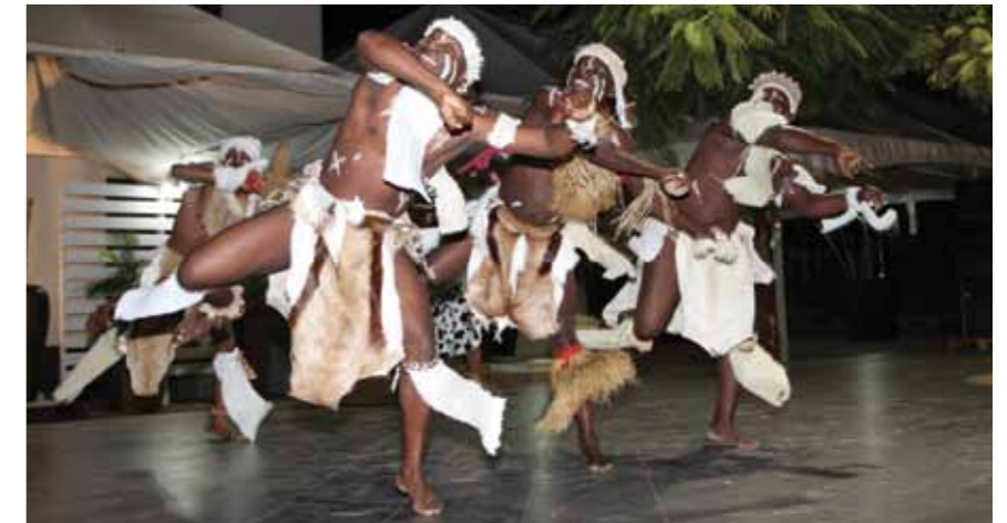
Kilandukilu Troupe exhibition