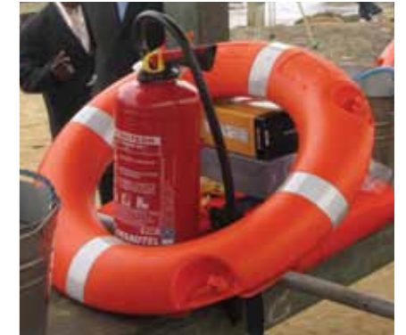
Sample of the equipment donated

CABGOC distributed radar reflectors, safety and protective equipment, GPS and other navigation tools and first-aid kits to more than 2,000 organized fishermen. The equipment is to be installed on more than 400 fishing boats in the North and South Tieiro region, Cabinda.