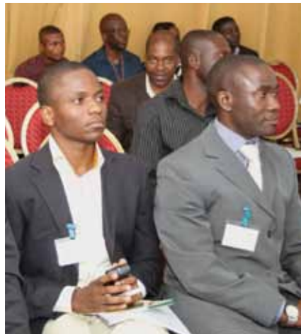
A very attentive audience at the CAE event