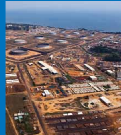
Aerial view of Malongo Terminal

In November 2010, the Malongo Terminal Operations group celebrated 20 years without a day away from work incident. Though 156 employees and contractors work in the terminal, many more work there on a daily basis as Malongo expands to handle increased production volumes. At times during the past five years more than 1,000 people worked in the terminal on a daily basis as SASBU completed processing and equipment expansion projects, installation of the second export system and a 600,000 barrel export storage tank, as well as Phase 1 construction of the Cabinda Gas Plant.