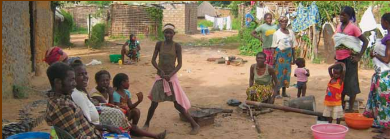
A meeting with the community