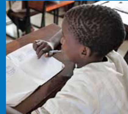
Students and teachers actively participated in the writing contest

'I will certainly stick to these books from now on.'