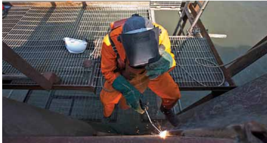
At Chevron, safety is always a priority