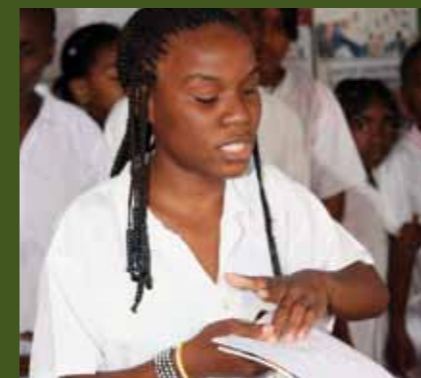
Reading Braille text at Óscar Ribas school