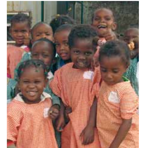
Children of Pequena Semente Orphanage

Cabinda Food Donations: Provided food aid to more than 500 children and elderly housed at various charitable institutions and orphanages with donations by Block O partners.