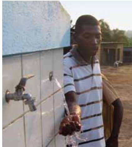
Potable water for the community