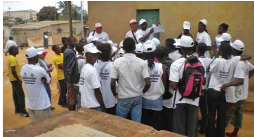
Volunteers receive instructions before going into the community to provide wild polio virus vaccinations

Working with local health authorities, CABGOC gave support to help coordinate and supervise the campaign, to provide food, fuel and equipment, and to help mobilize the