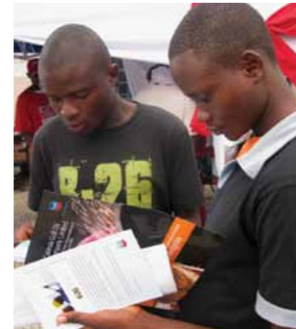
Two attendees at the HIV awareness fair in Cabinda

In 2010, CABGOC continued its commitment to support the government's efforts in the battle against HIV/AIDS and other infectious diseases contracted through blood transfusions, and to help support those infected and affected by the pandemic diseases. The company contributed US$350,000 to the Cabinda hospital blood transfusion services to provide health professional and community training, purchase equipment and