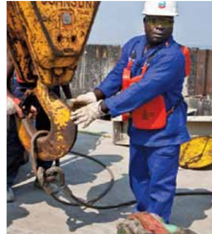
Do it safely or not at all