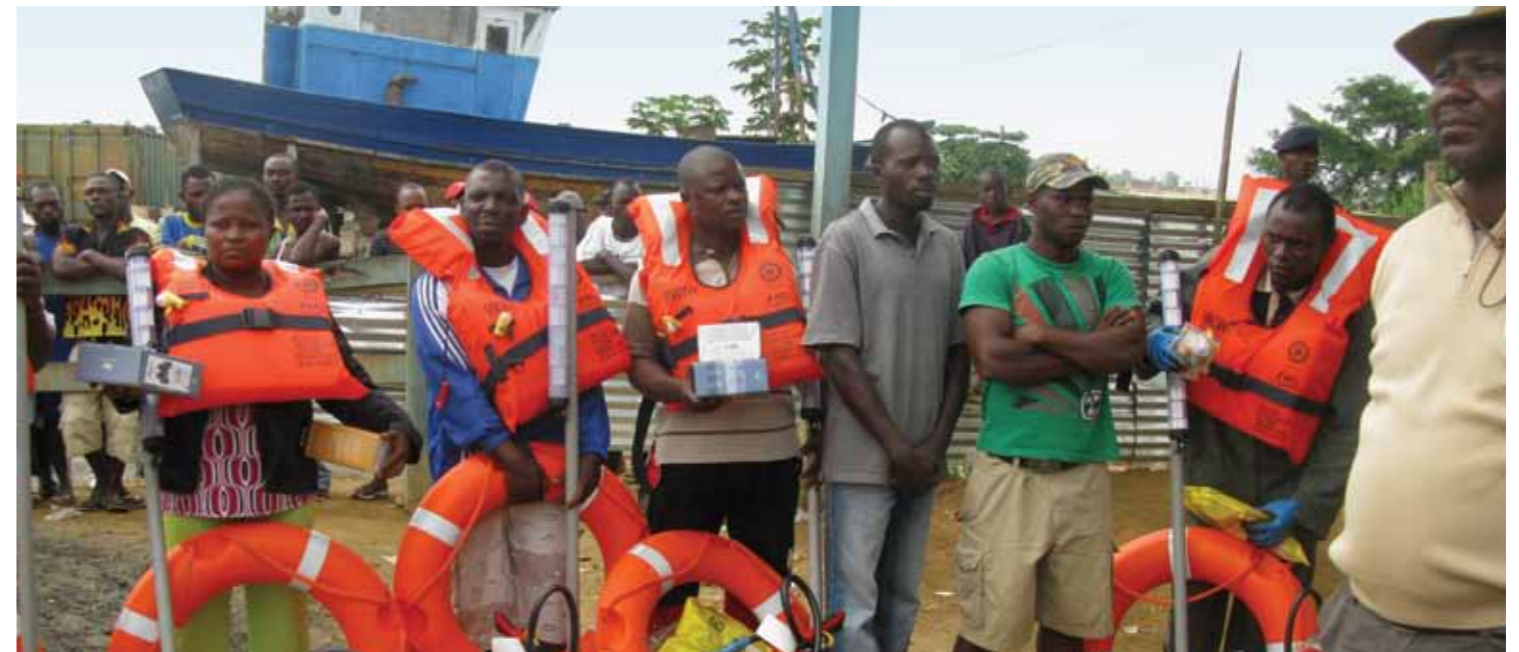
Community members at the equipment donation event of the Cabinda Fishing Sector Project (FiSS)