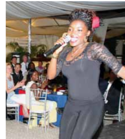
Singer Perola performing at a Chevron event