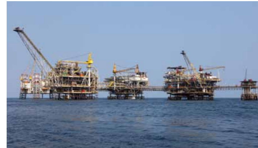
Takula Platform Complex

We are Angola's largest foreign oil industry employer with approximately 3,130 Angolan employees - 88 percent of our workforce in the country. Angolans fill 76 percent of the local professional and supervisory roles at Chevron in Angola.