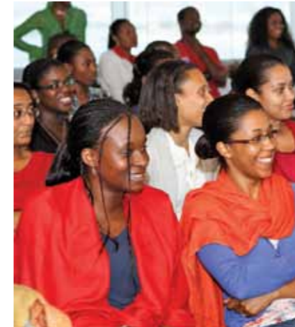
Angolan nationals are 88 percent of Chevron's workforce in the country