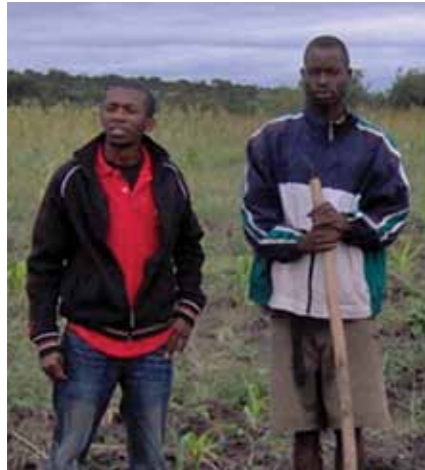
Two farmers from Nova Wangué Farmers' Association