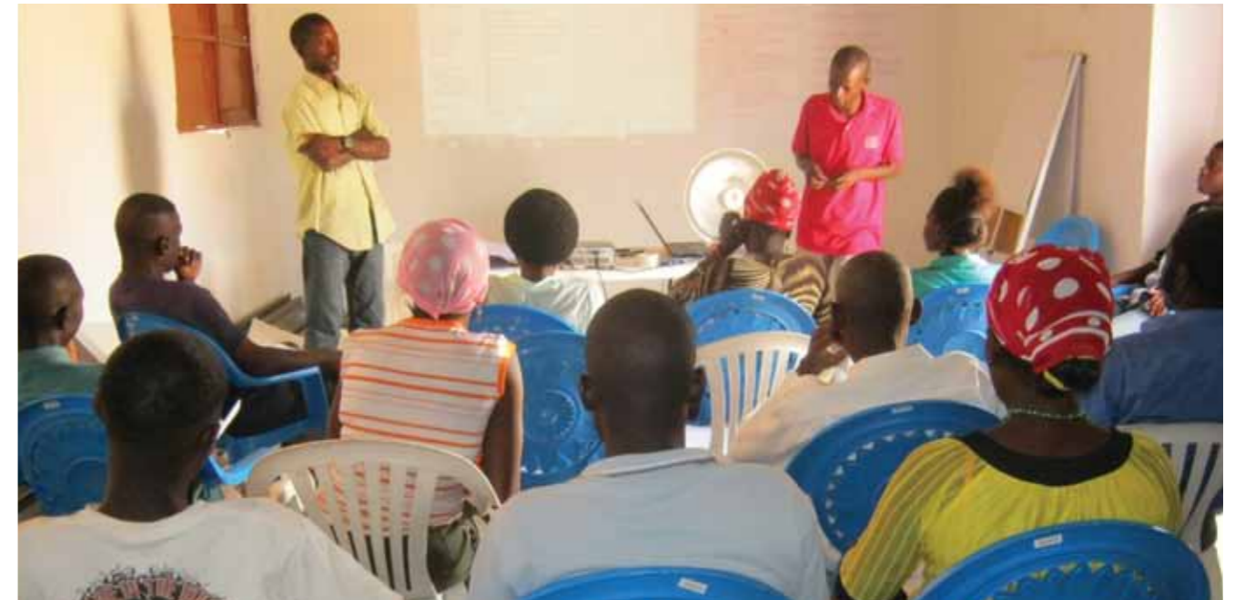
Social advocacy training of MDP participants