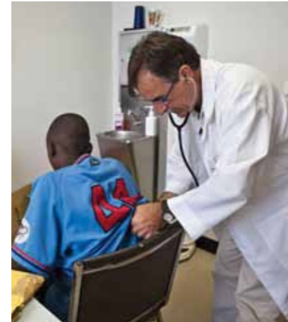
Polio vaccination campaign

The Social Bonus Servindo a Comunidade project trains community health activists to disseminate information and best practices in Malanje Province. The project addresses major public health issues and preventable diseases, such as malaria and HIV/AIDS, and encourages best hygiene practices. The outreach health program is implemented by Africare in the municipalities of Cacuso and Cangandala. The project