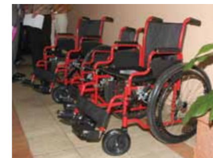
Wheelchair donation to Fundo Lwini