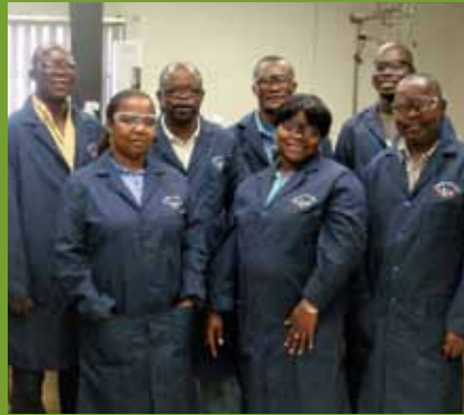
Members of the Malongo Lab team

The team of 61 Angolan employees at CABGOC's Malongo Lab has expanded its skills and built a reputation for accuracy. At facilities onshore and satellite labs offshore, the team works around the clock analyzing thousands of samples each month including crude oil, produced water, gases, lube oil and refined products. For more than a year lab employees participated in hands-on training and personal mentoring to become one of the Chevron labs with the capability to conduct environmental "fingerprinting" analyses, a complex, multistage technique for identifying the composition and origin of oil. If a spill is discovered in CABGOC-operated waters, fingerprinting can help determine whether it came from CABGOC or neighboring operations.