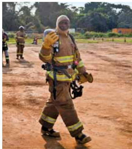
The right equipment for the right task