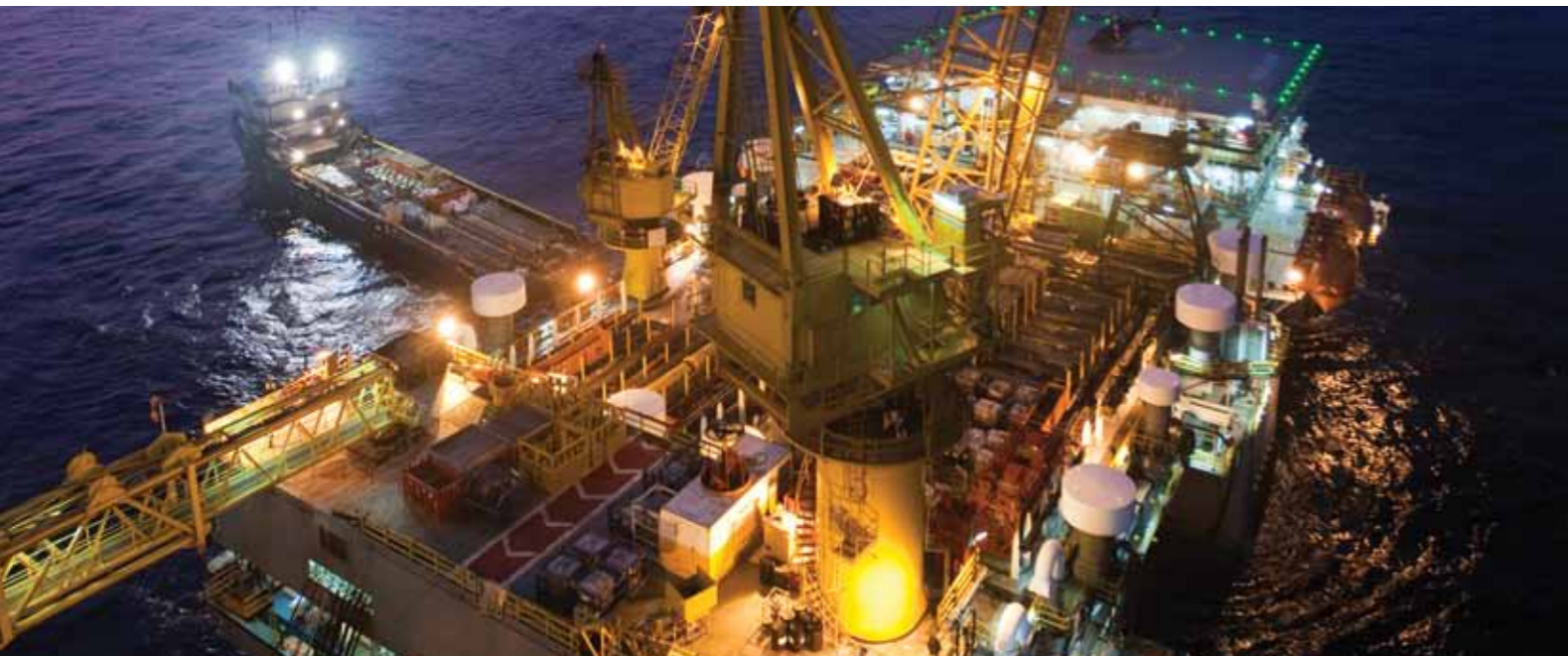
Tombua-Landana Platform at night