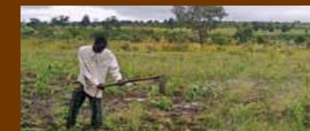
Corn cultivation is included in the agriculture project supported by MDP

'MDP helped us achieve one of our greatest dreams. Our children do not have to walk four kilometers to school anymore.'